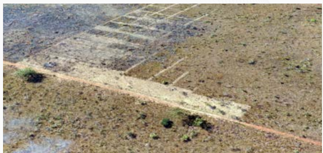
A drone-produced orthomosaic combined with a digital surface model, shown in Esri ArcScene, that details the extent of clearance by manual deminers on a HALO Trust minefield (the clearance activity is visible as a lighter coloured grid).